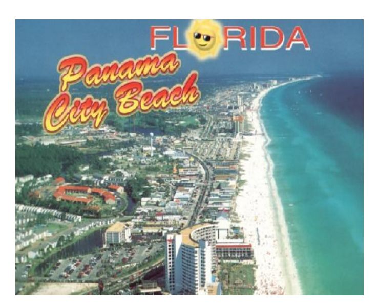
Panama City Beach, Florida

If you are interested in attending, please contact us at 770-714-5775.